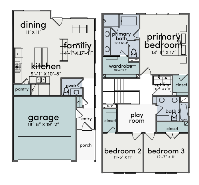
PLAN B 3 BD | 2.5 BA | 1,760 SQFT

First Floor Second Floor First Floor Second Floor