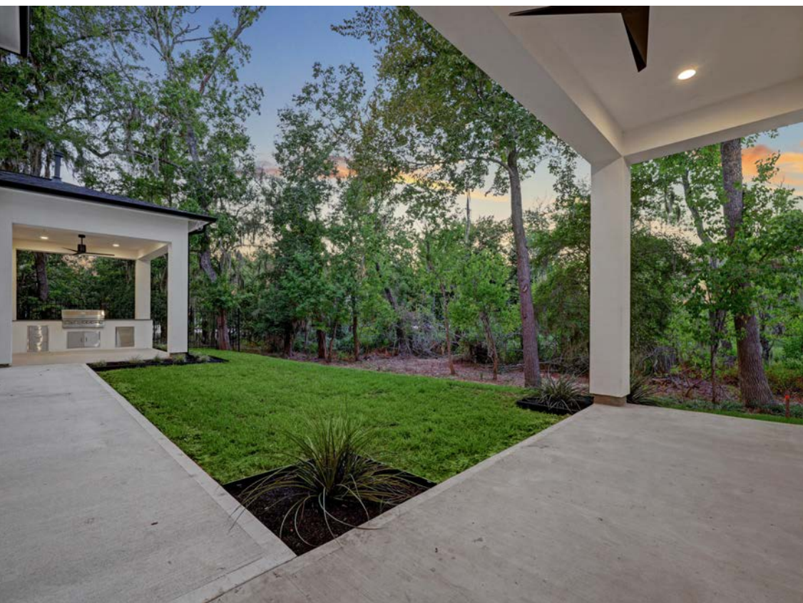
Perfect for family memories and a future glistening pool.