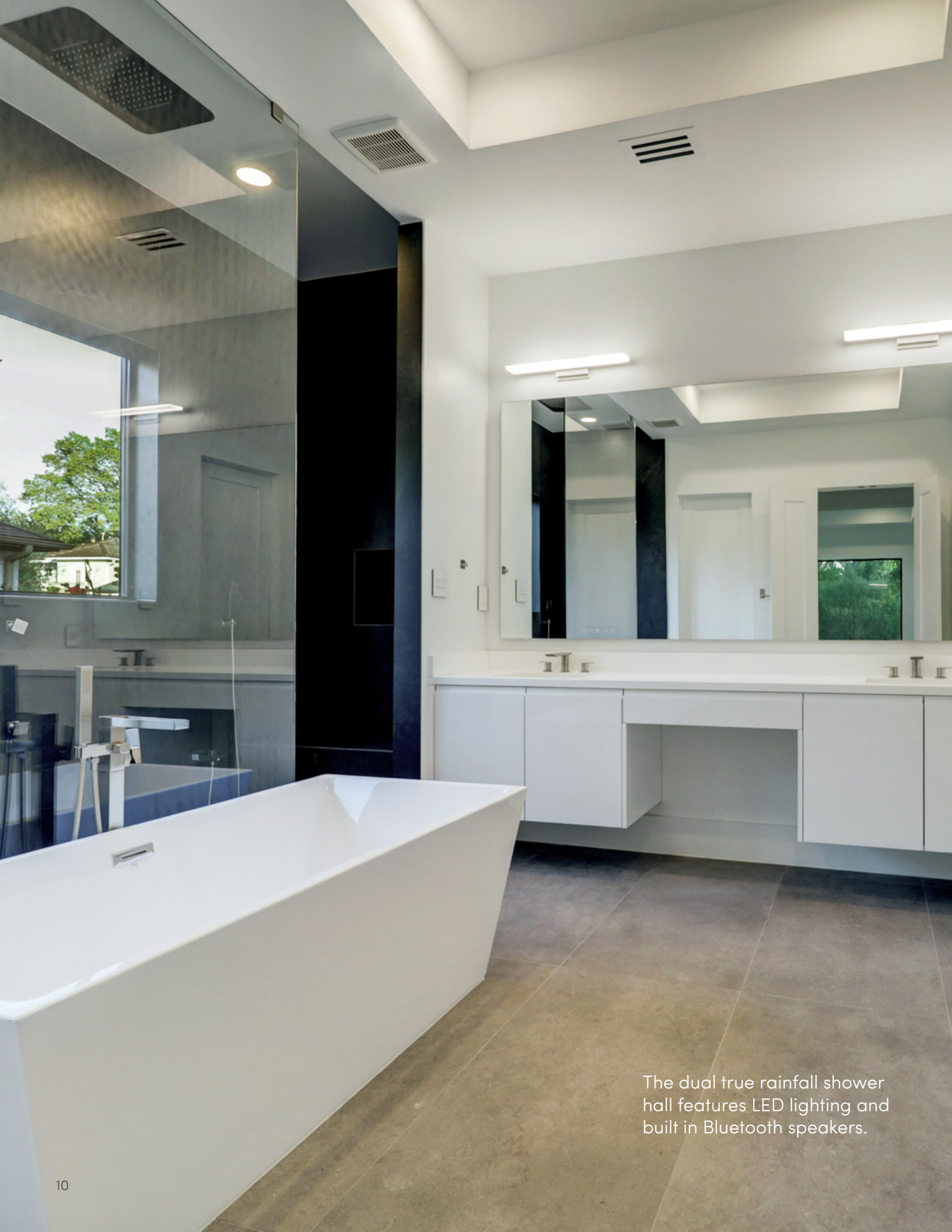
The dual true rainfall shower hall features LED lighting and built in Bluetooth speakers.