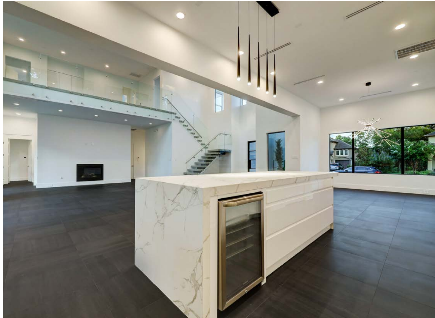
An obsession with quality can be seen and felt in every last detail.