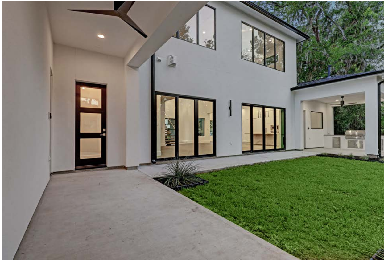
Enjoy the perks of no back neighbors with a forest view that creates a cozy cabin feel.