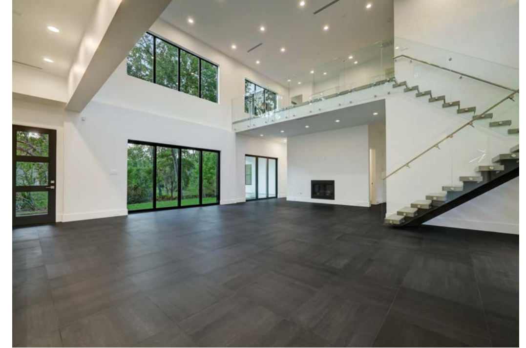
Bright, light, open spaces. The neutral colour palettes and floor to ceiling windows work together to flood living spaces with natural light.