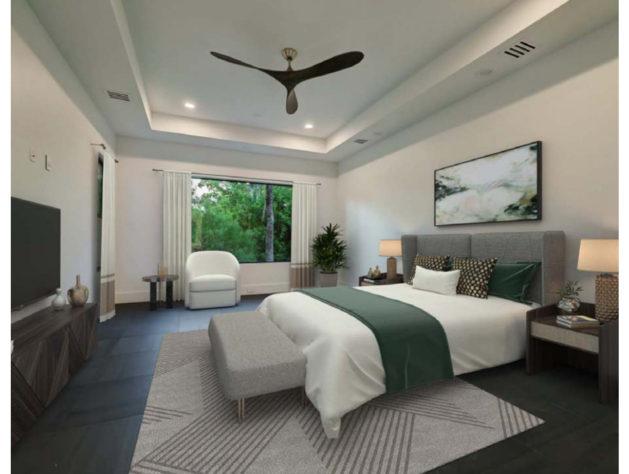
Retreat to the primary suite, a Spain inspired ensuite bath that rivals the most luxurious resorts.