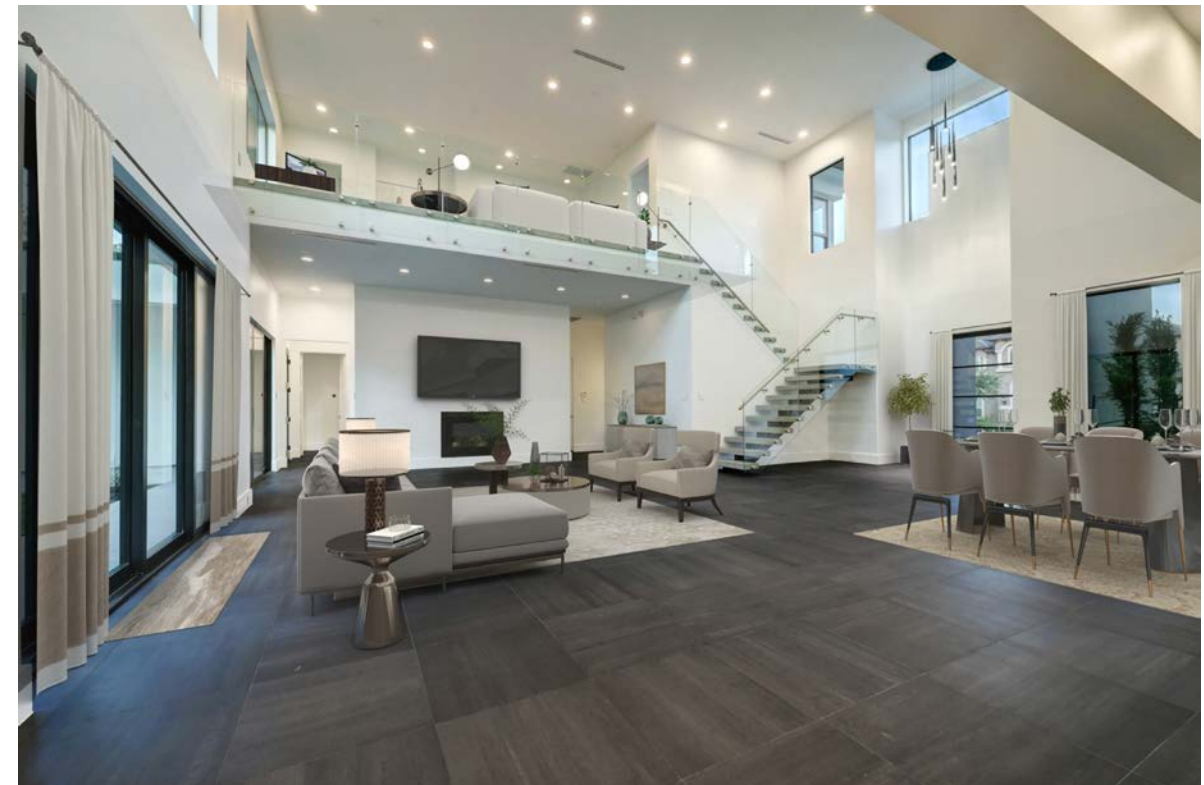
Entertain in the spacious living area, where the boundaries between indoor and outdoor living blur effortlessly through sliding glass doors, revealing an oasis of lush landscaping & nature.