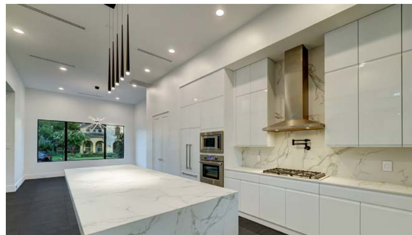
Integrated kitchen with function, luxury, and style.