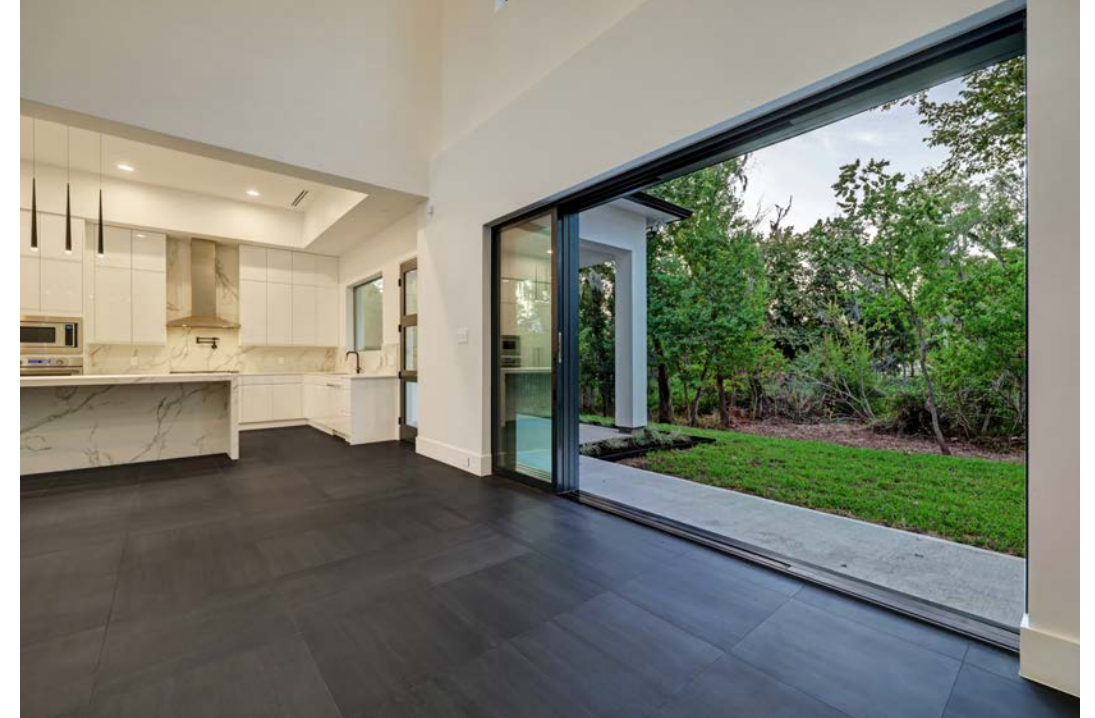
Floor-to-ceiling windows provide the highly desired benefit of flooding the space with abundant natural light.