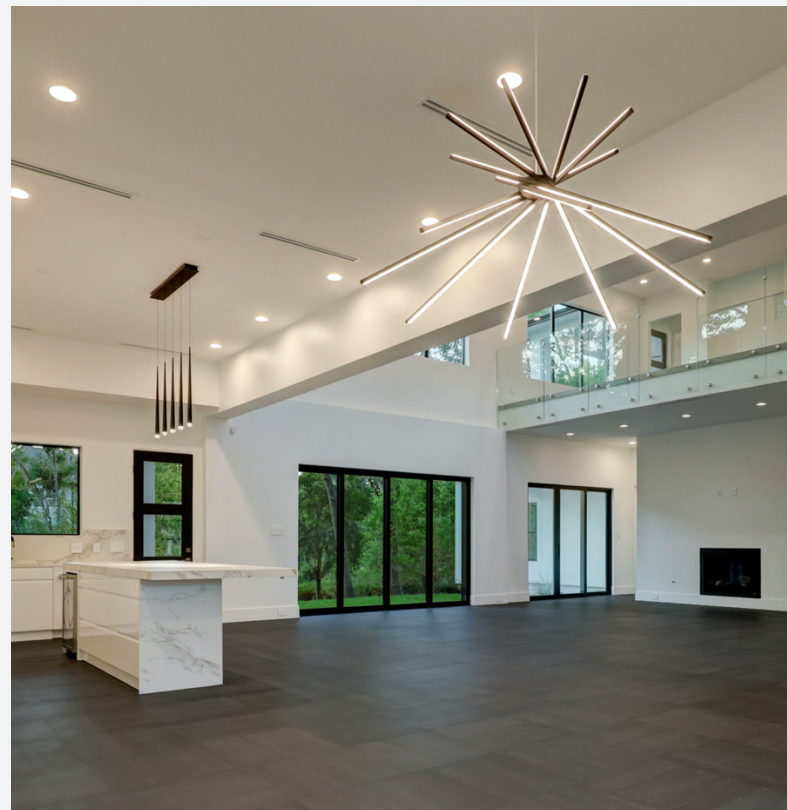
The heart of this residence lies within the chef's kitchen, featuring a massive Dekton island with a built in wine cooler, and Fisher & Paykel appliances showcasing clean and seamless cabinetry.